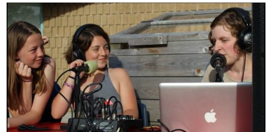
CFRU FM broadcast live from the BBQ

We celebrated at Gateway Public School with food provided and prepared by the Lions Club of Guelph and cake and ice cream from Parkwood Gardens Church . There were games to play, face painting, buttons to make and other fun activities. The Mayor dropped by and hung out with our awesome Camp Staff!