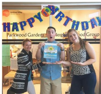
PGNG Office at the WECC (left) Community BBQ 2000, Springdale Park (below)

Before too long we started getting support from the City of Guelph with booking community spaces like parks and eventually some funds to hire our first part time staff person. Having a dedicated staff person allowed us to expand the programs we offered even further because they could supervise/co-ordinate even more volunteers and more programs, including our first summer camp in 2000. (Continued next page)